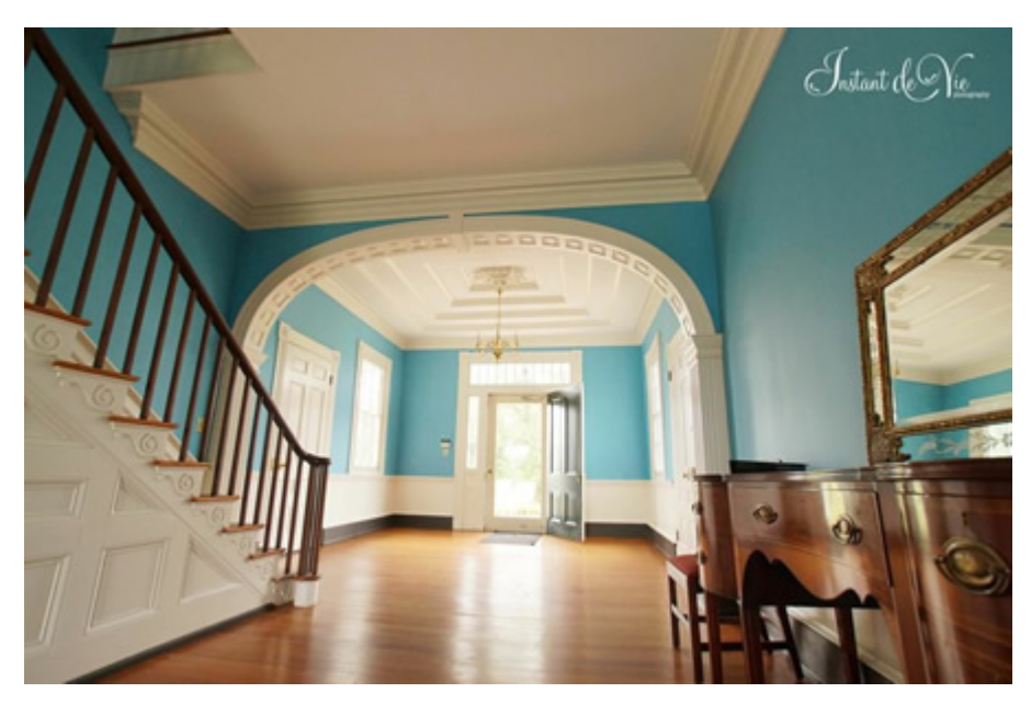
The Grand Hall at Belle Grove

The place was buzzing with excitement, last minute repairs, landscaping, cleaning and all sorts of preparation to present the plantation in all its grandeur to the public. I was met with the smell of fresh paint and summer air as I made my way into the rich hardwood Grand Foyer. The only thing missing among the lavish colored walls and ceilings ornate with antique chandeliers was the majority of the furniture, scheduled to arrive just days after my visit. The pieces that I was lucky enough to catch a sneak peek at were absolutely exquisite.