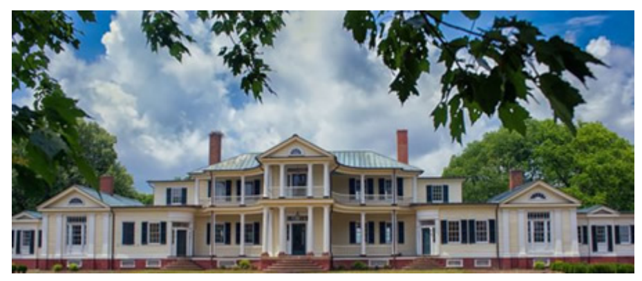
Belle Grove Plantation Bed & Breakfast

In the outstretched basement I found a sauna and Japanese soaking tub; all a girl needs on a getaway, right?! Eventually, the Darnells plan to install their very own "man cave" down there, complete with oversized leather couches perfect for relaxation. Until then, guests will be sure to marvel over the number of original wooden beams still holding the house from the day James Madison was born.